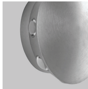
-16 Brushed Aluminum

LIGHT SOURCE (12x) 1.5w LED Arrays, 3000K, CRI 90